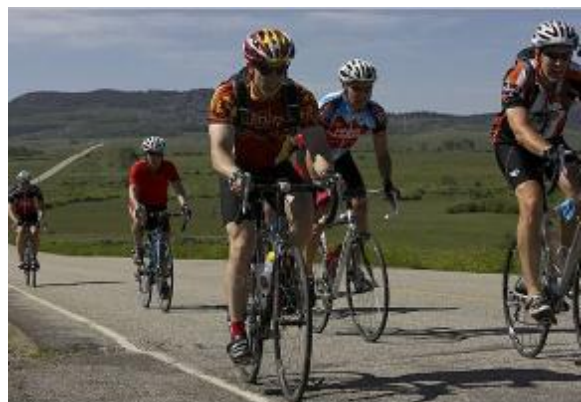
Front Rangers at the Bicycle Tour of Colorado